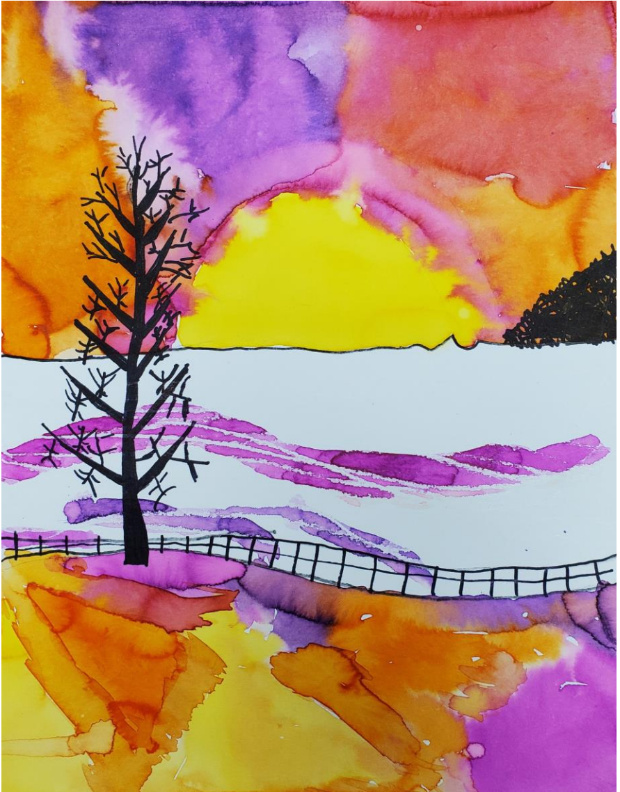
EXHIBIT A CARISSA BRAMLET