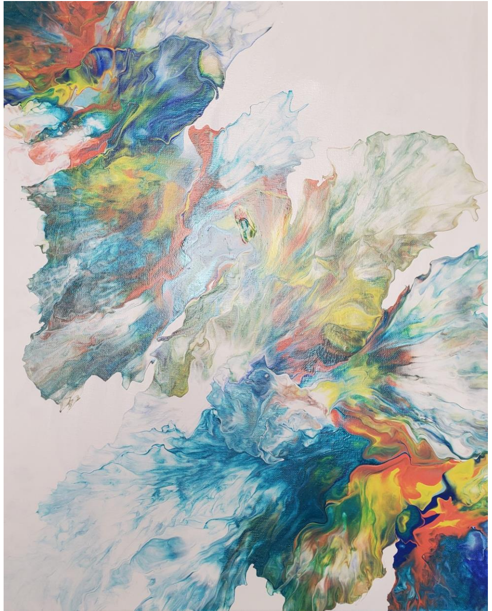
EXHIBIT A GABBY BAUMAN