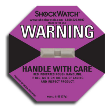
Figure 1 - Example of ShockWatch® Indicator

http://www.shockwatch.com.au/shipping and handling monitors/impact indicators/