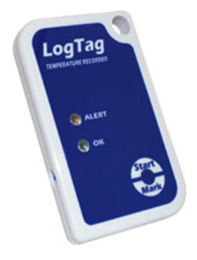
Figure 2 – Example of Temperature datalogger

http://www.shockwatch.com.au/shipping and handling monitors/impact indicators/