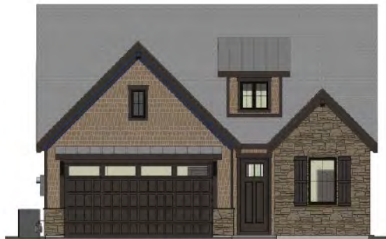
Tempe A (NOT TO SCALE)