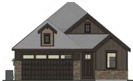
Tempe B (NOT TO SCALE)