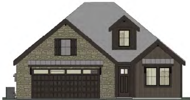
Gilbert A (w/ Bonus) (NOT TO SCALE)