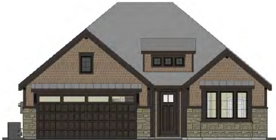
Avondale A (NOT TO SCALE)