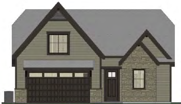
Pima A (w/ Bonus) (NOT TO SCALE)