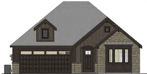
Avondale B (NOT TO SCALE)