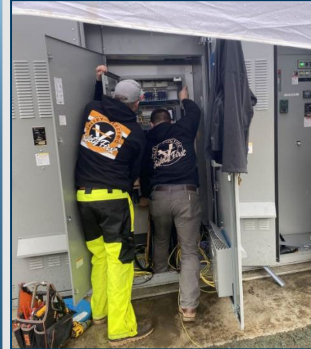
Electricians installing the SCADA panel at PS 11.