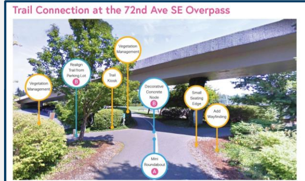
Alternative B: "Realigned Mindset"