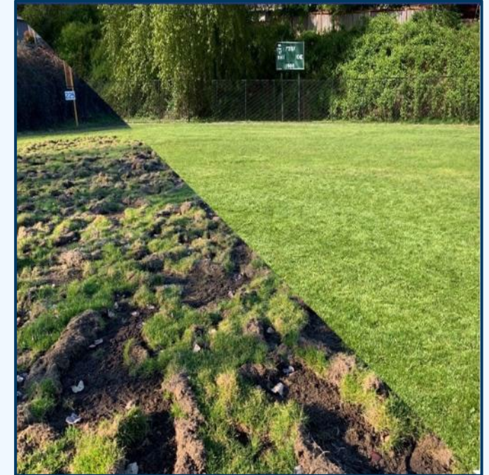
Before and after restoration efforts