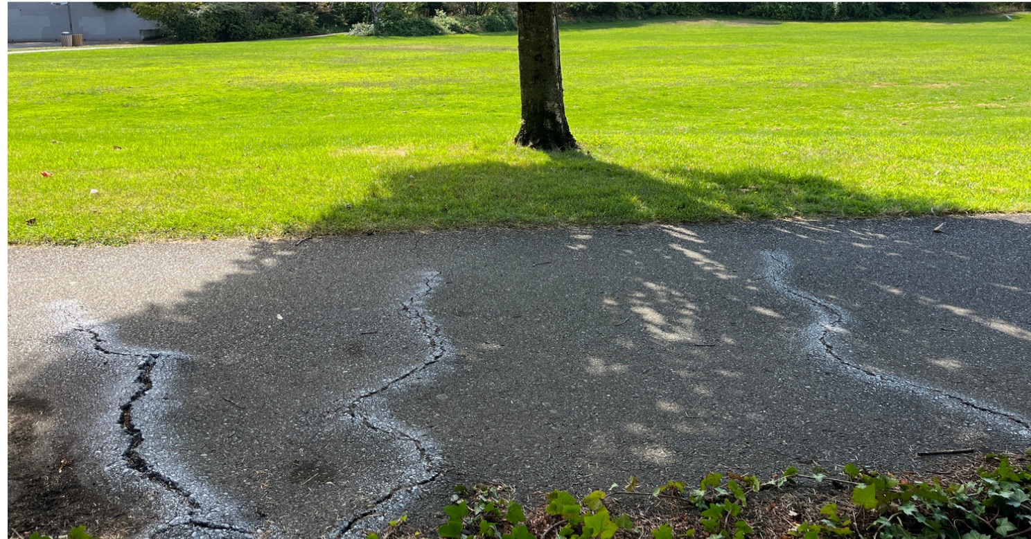
Aubrey Davis Park Area B