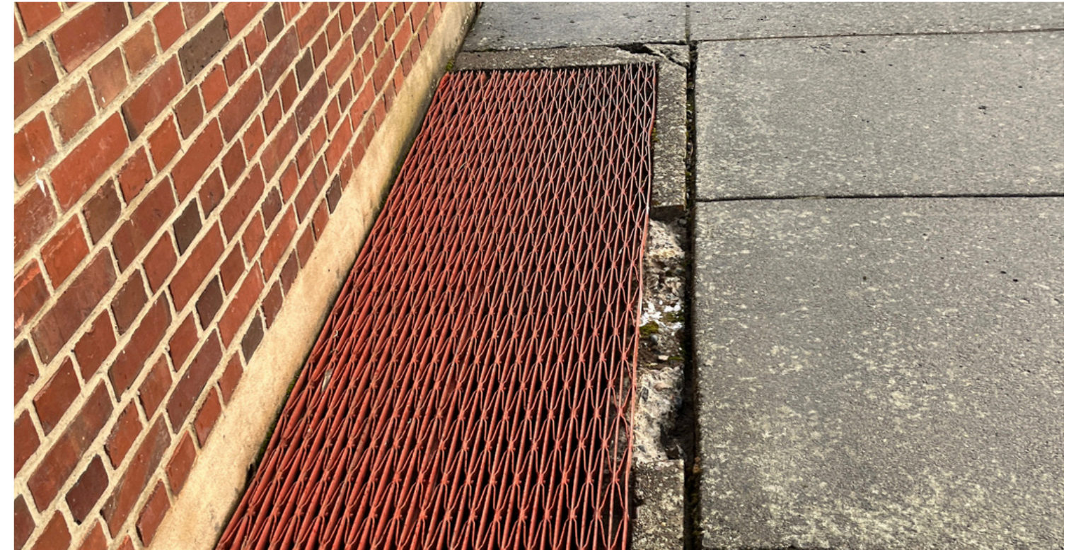
Luther Burbank Park Near Admin Building