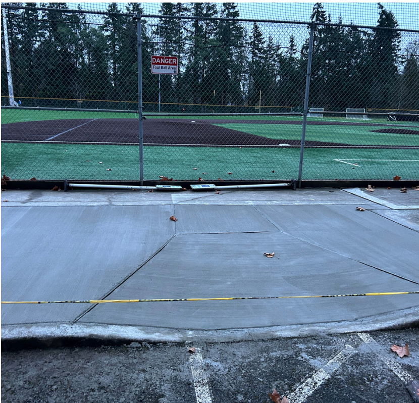
ADA parking ramp (after)