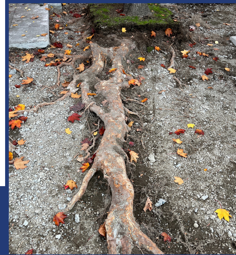
Sidewalk Tree Removal