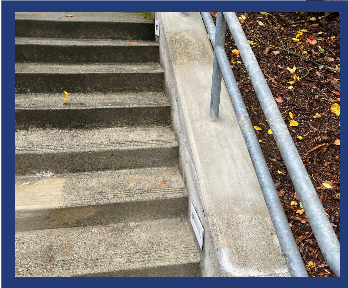
Stairs from MICEC to Luther Burbank Park (After)