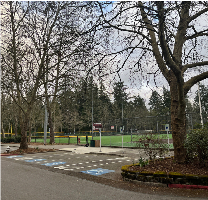
ADA parking ramp (before)