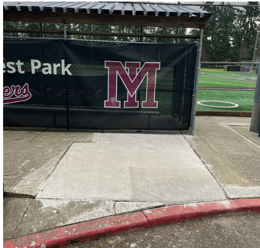
Sidewalk & Dugout