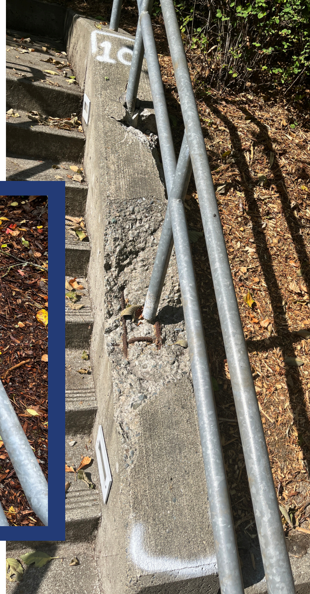
Stairs from MICEC to Luther Burbank Park (Before)