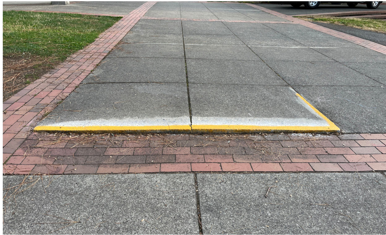
Island Crest Park ADA Stalls