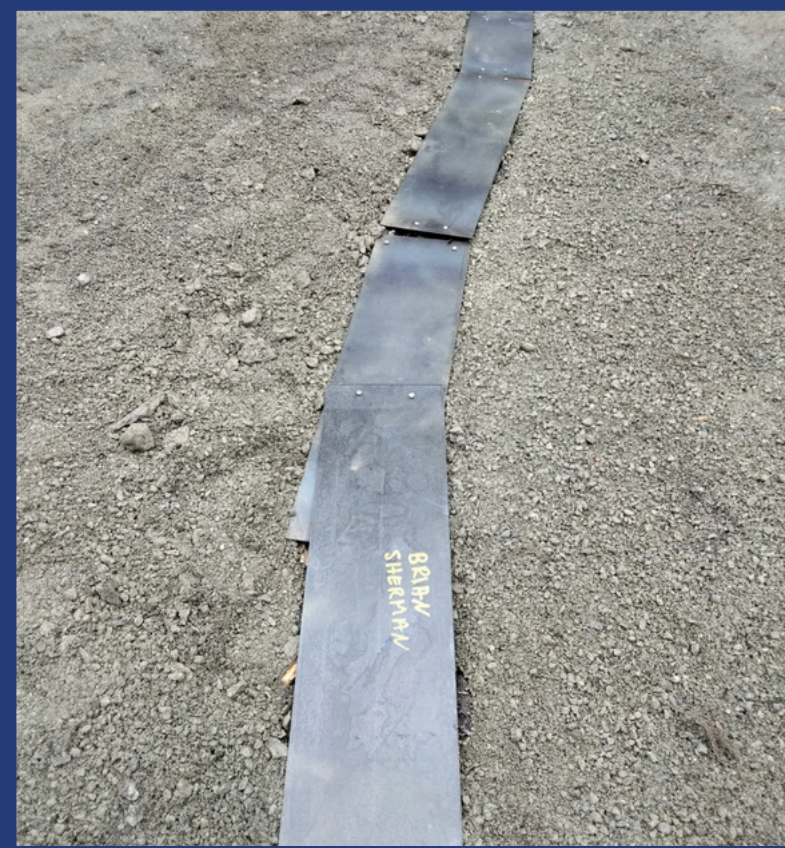
Steel Plate Remediation