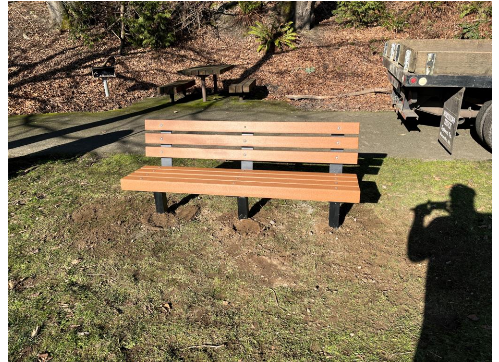
*Newly installed bench at Clarke Beach.

https://www.mercerisland.gov/parksrec/page/park-enhancement-donations