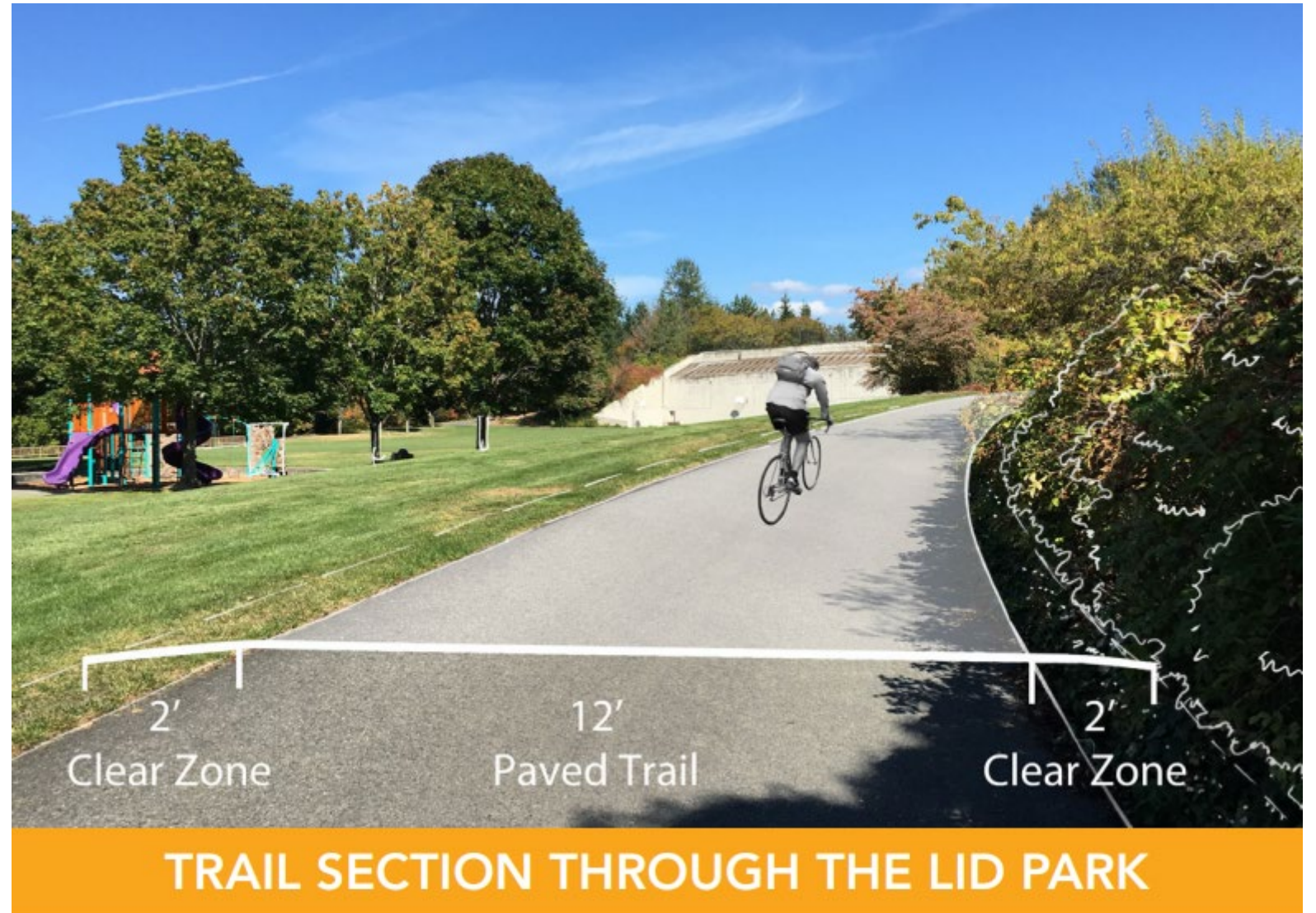
TRAIL SECTION THROUGH THE LID PARK