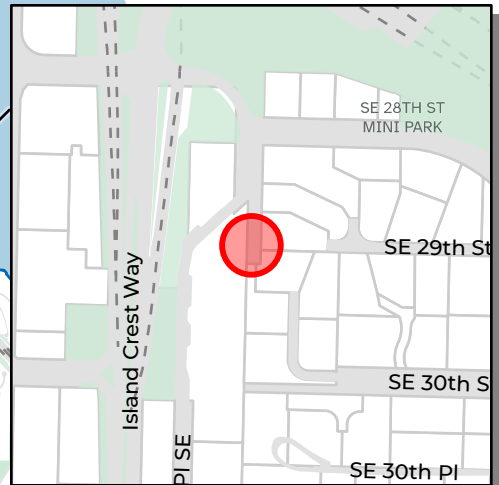
Station B3-D 2835 82ND AVE SE