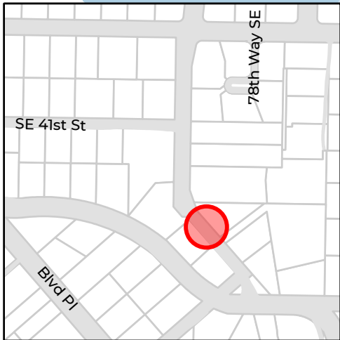
Station D3-A 4110 78TH AVE SE