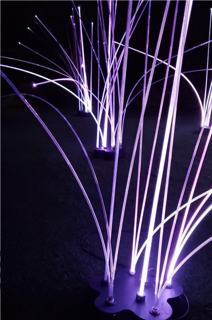
Prairie of Possibilities

Temporary public art exhibit by the Moonlight Collective