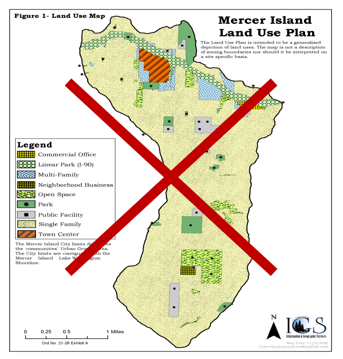
(Ord. No. 21-26, § 1(Att. A), 1-4-2022)