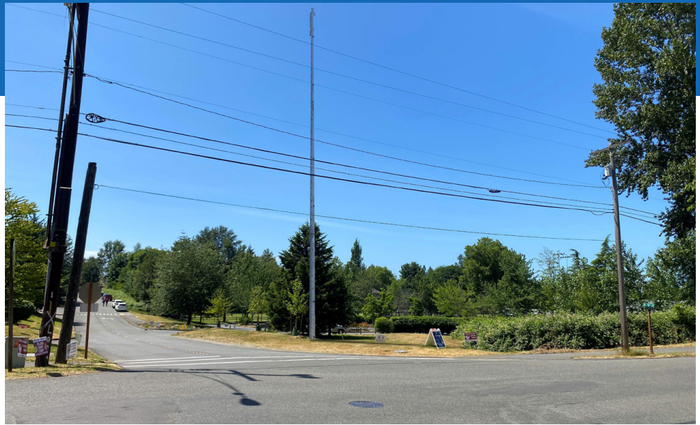
Rendering of proposed data collection equipment on a new 80-foot pole near South Mercer Playfields.

public comment period, and the public hearing date and time. Anyone may comment on the application, receive notice, and request a copy of the decision once it has been made.