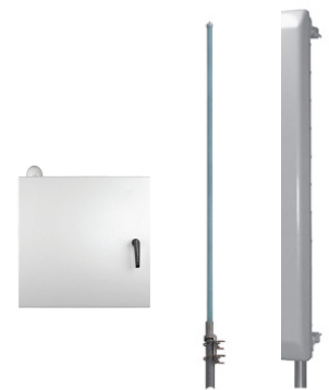
Example base station and antenna equipment