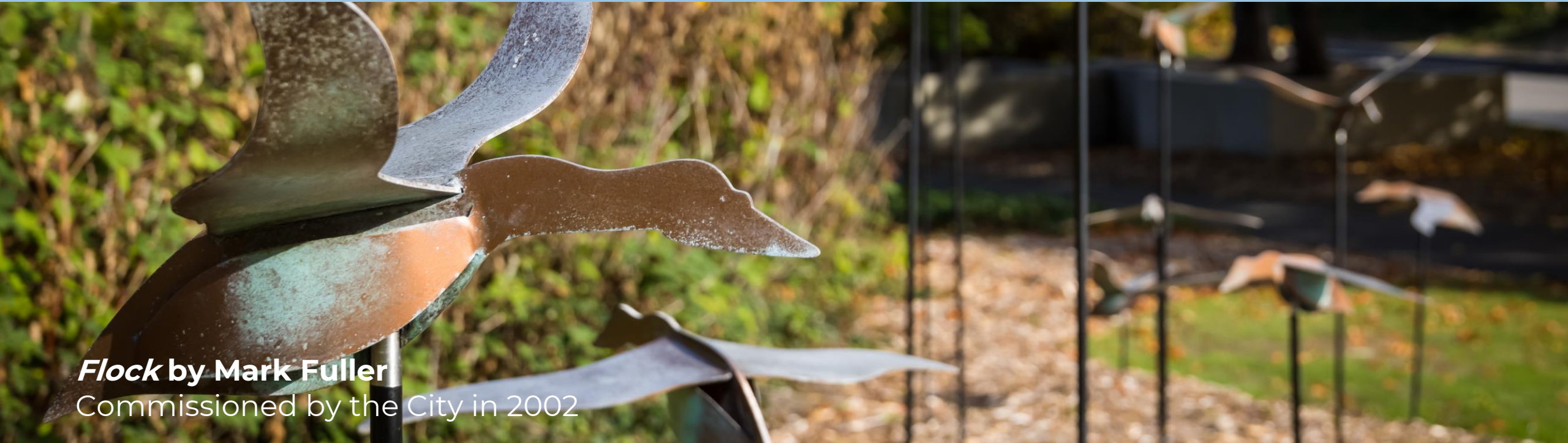
Flock by Mark Fuller Commissioned by the City in 2002