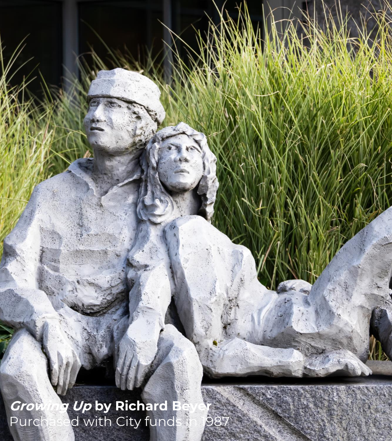
Growing Up by Richard Beyer Purchased with City funds in 1987