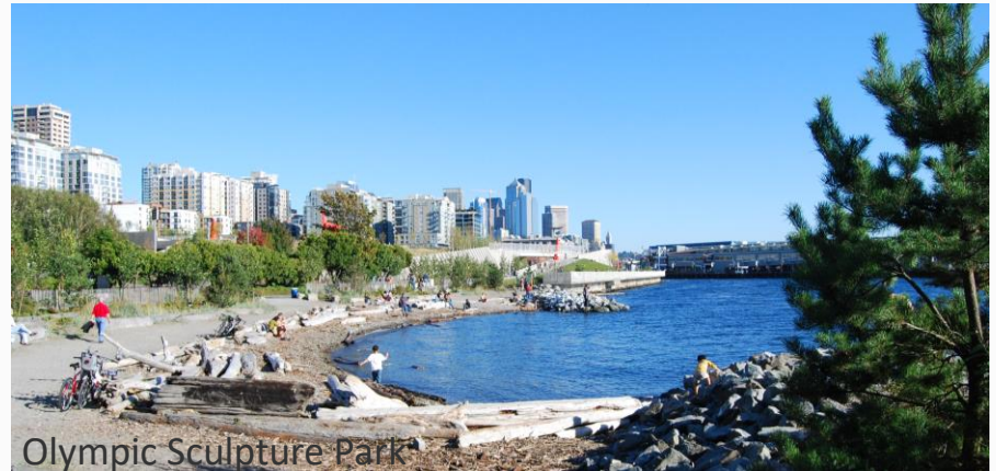
Olympic Sculpture Park