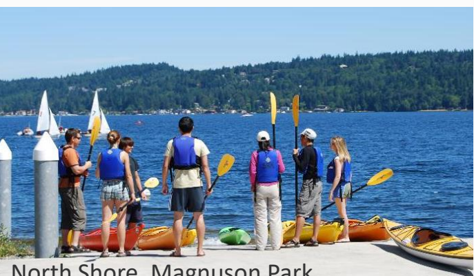
North Shore, Magnuson Park