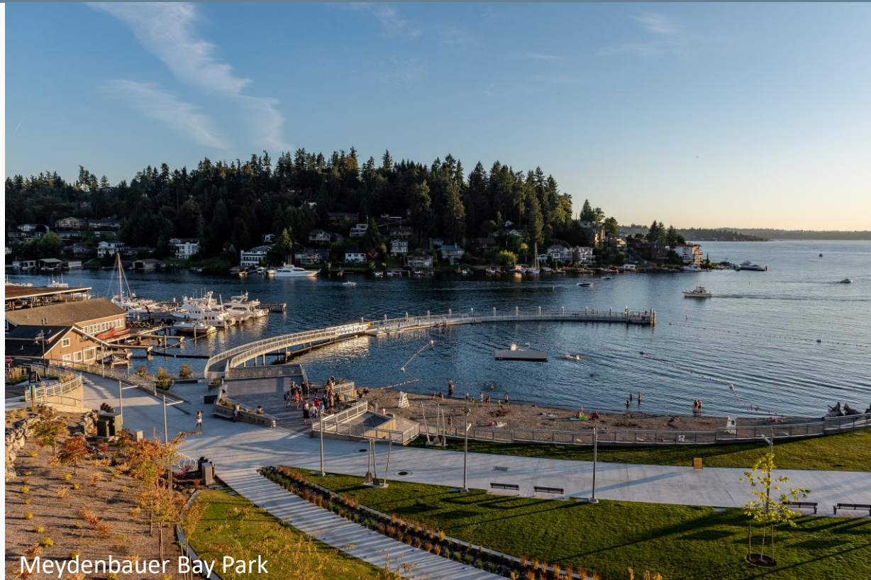
Meydenbauer Bay Park