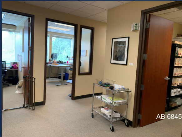
AB 6845 | Exhibit 1 | Page 5