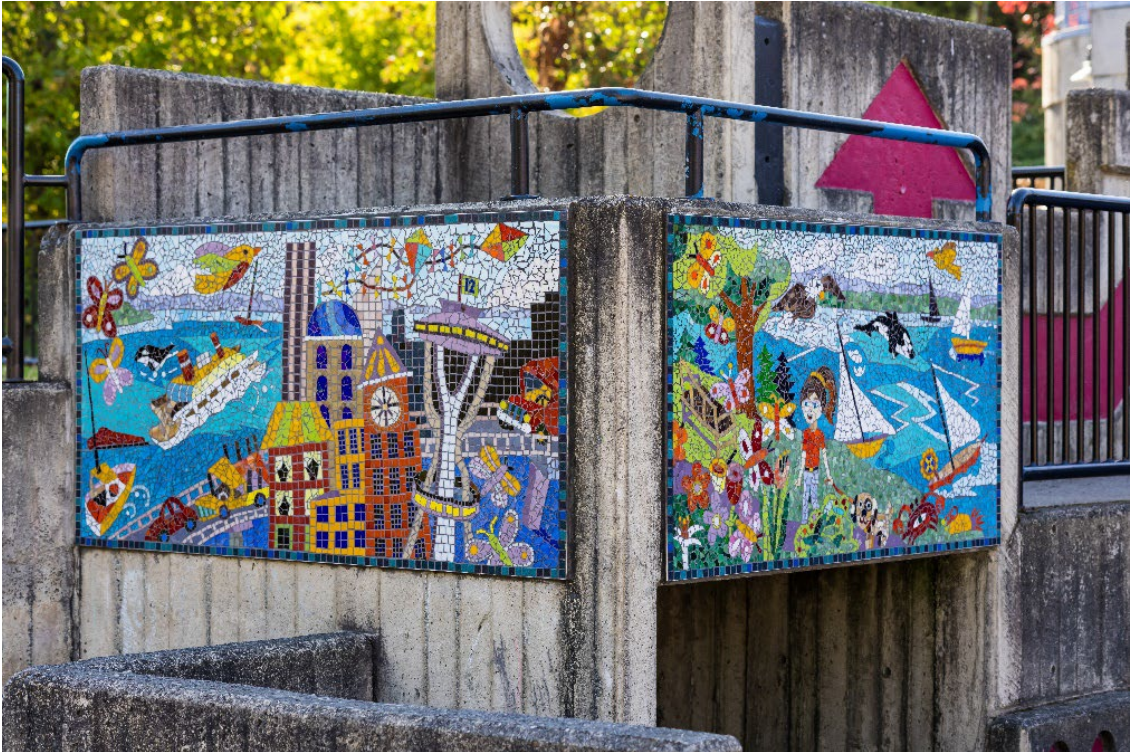
Flight of the Butterflies – Installed in Luther Burbank Park play area