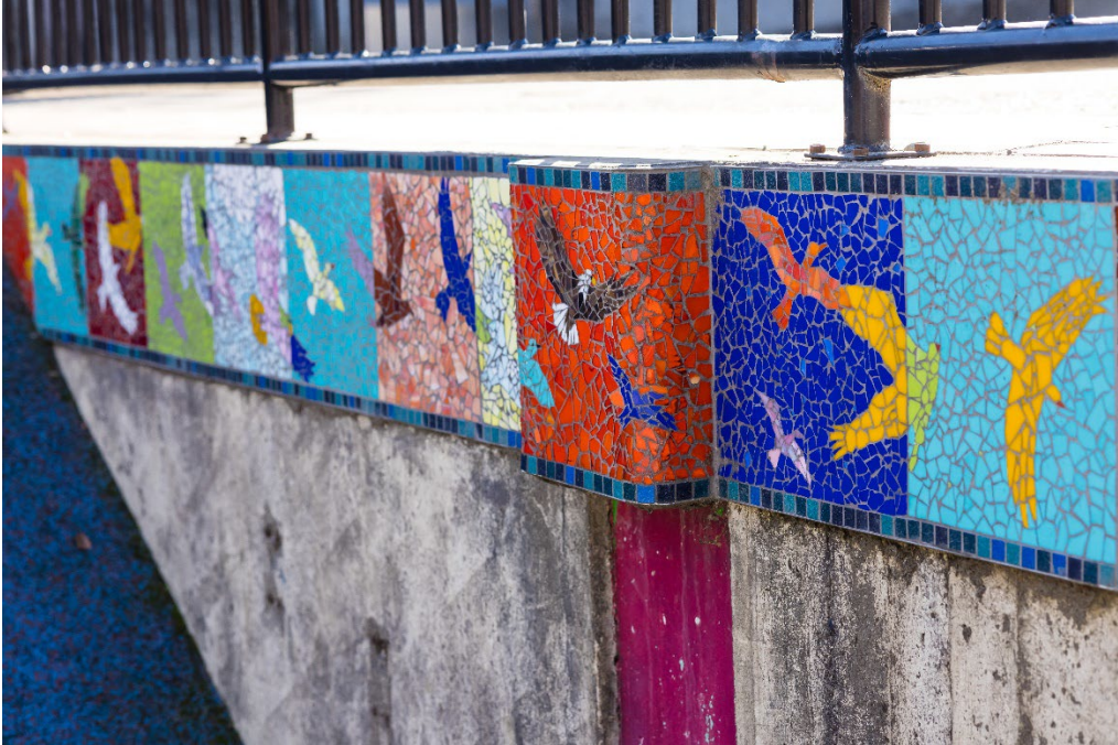
Soaring – Installed in Luther Burbank Park play area