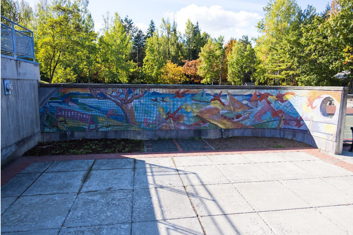
Birds in Flight – Installed on concrete wall next to Luther Burbank Park sport courts