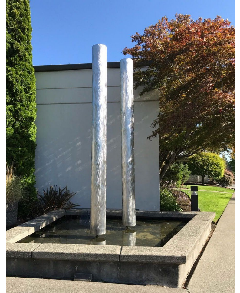
Sentinel , 1990. Stainless Steel and Concrete. Former Mercer Island City Hall.