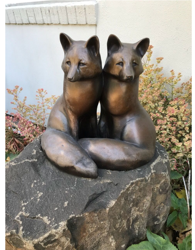
Twin Foxes , 2015. Bronze Statue. Former Mercer Island City Hall.