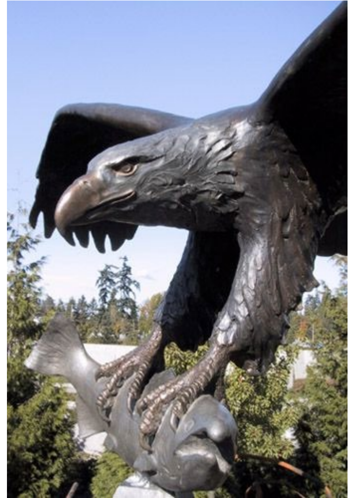
Mercy, 2000. Bronze Statue. Pedestrian overlook at the I-90 trail.