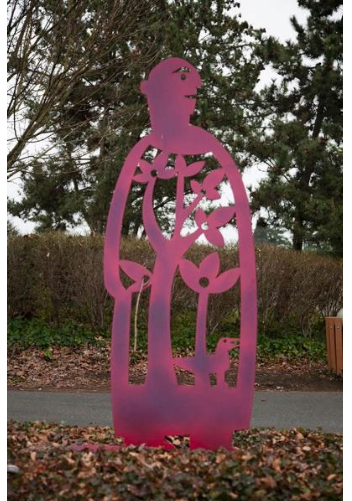
Gateway, 2015. Galvanized Steel. Greta Hackett Outdoor Sculpture Gallery.

Ordinance No. 25C-19 adds the option for the City Council to exempt or partially exempt qualifying projects from contributing to the 1% for Art in Public Places Fund.