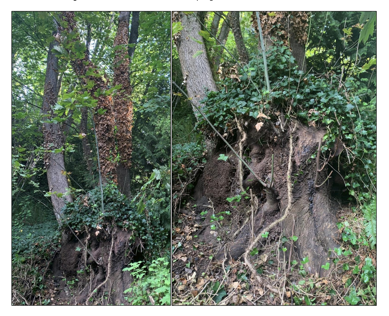
Picture 1. 2237 Evergreen Point Road – Extensive basil decay. High risk.