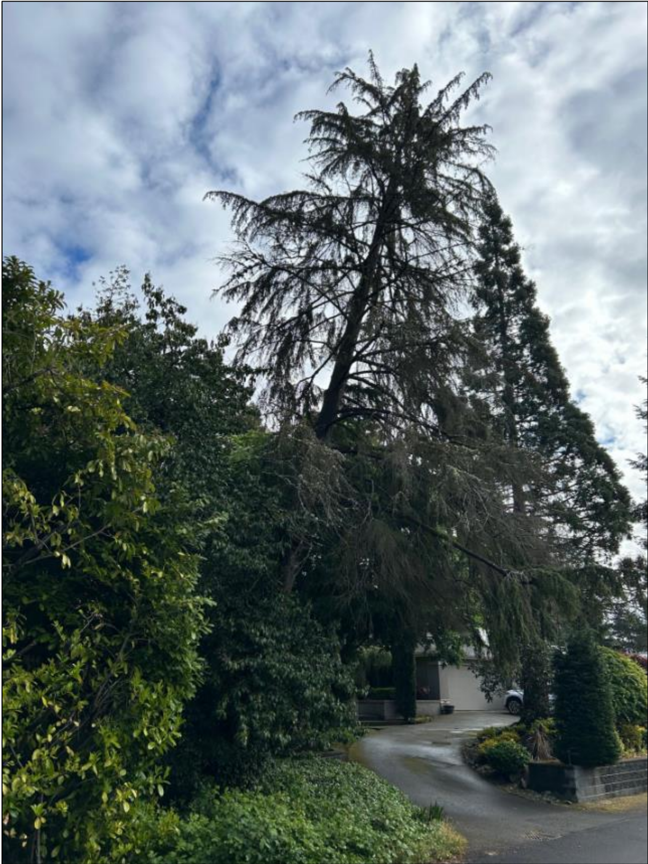
Picture 3. 7622 NE 14th Street – Dead and hazardous Western hemlock.