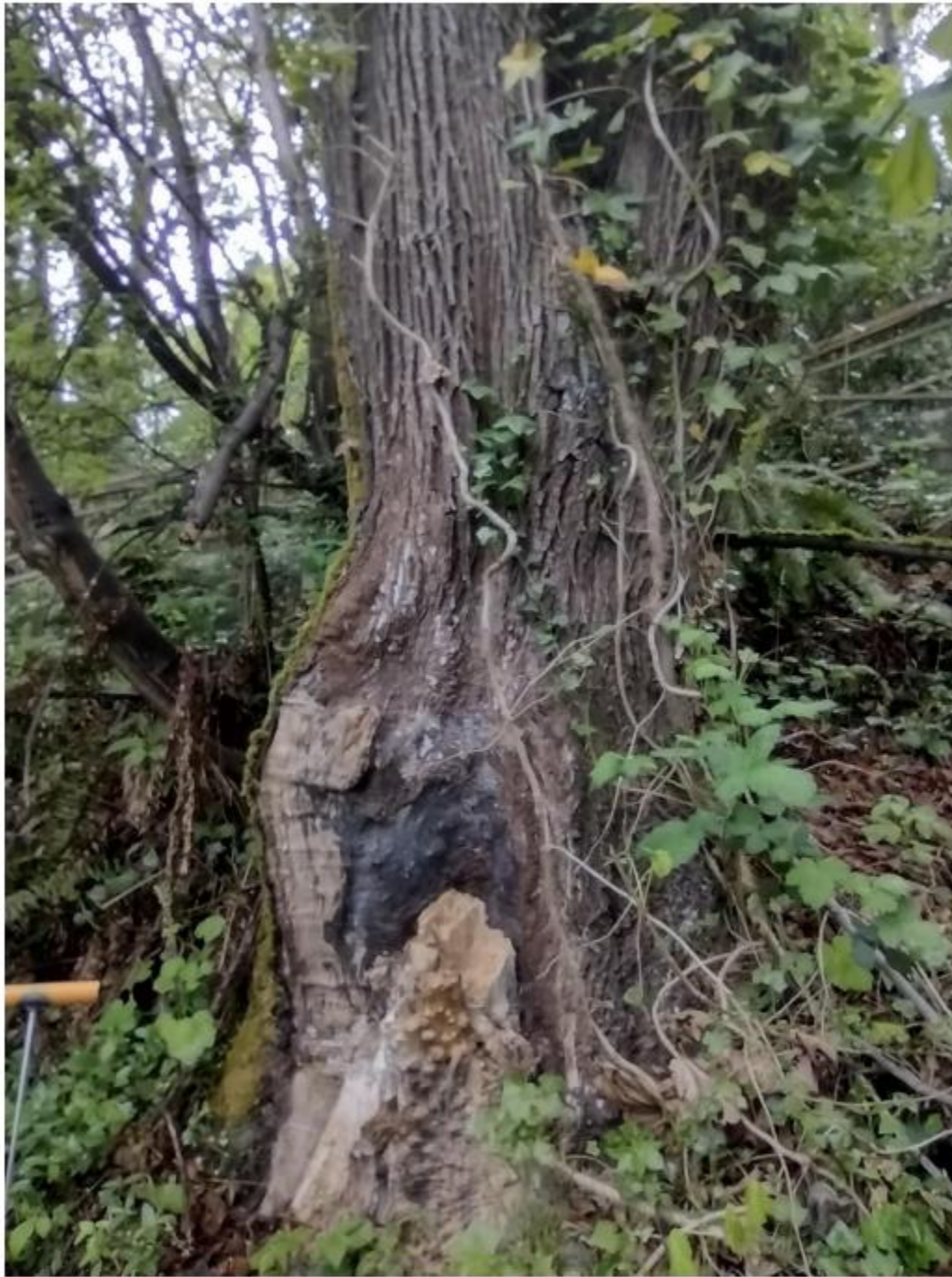
Showing location of failed stem and wound at base of tree.