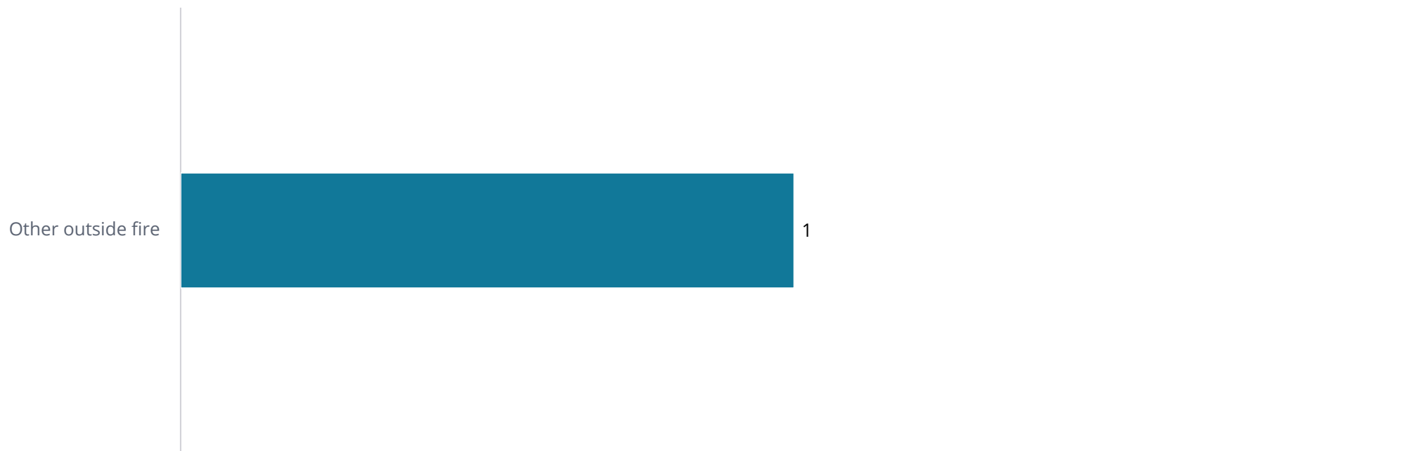
Count of Fire Incidents

Filters Incident onset Last Month | Incident status Locked, Draft, InReview | Location city MEDINA, Medina