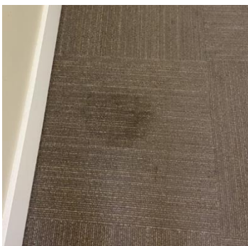
Eastside of Main Floor