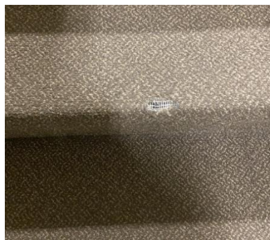
Stairs - Upper Level