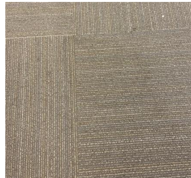
Top of Stairs – Top Floor