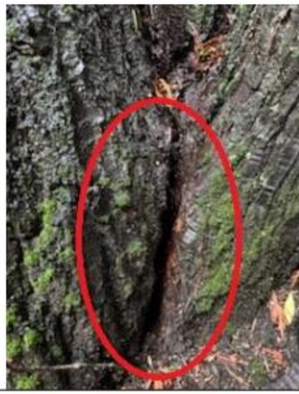
This is a photo showing the gap between the two trees (it was not there prior to the most recent storm).