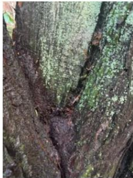
Another photo showing the area the tree used to touch (this area is flat and discolored).