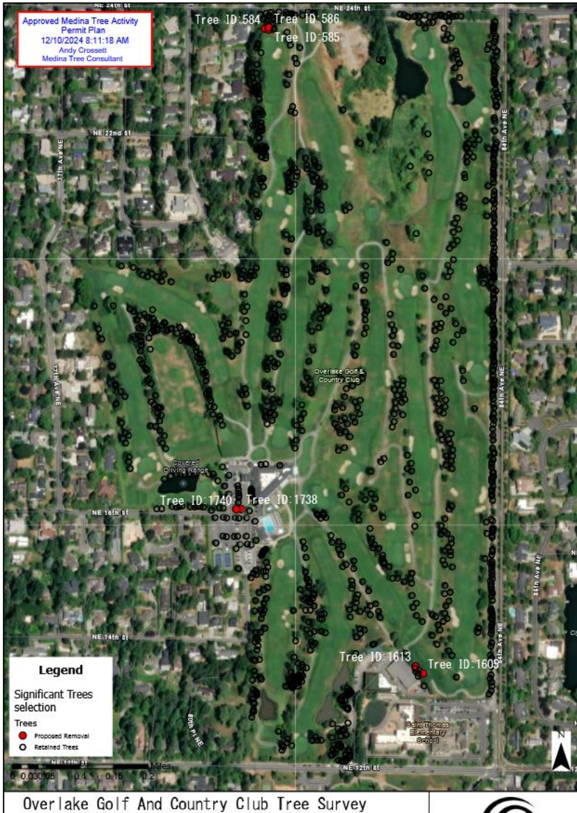
Picture 1. Overlake Golf Club