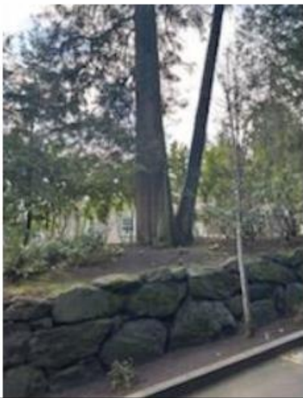
A photo looking SW showing the lean of tree #1317 and its location.