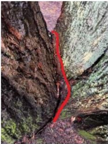
A photo showing the area the tree used to touch (this area is flat and discolored).