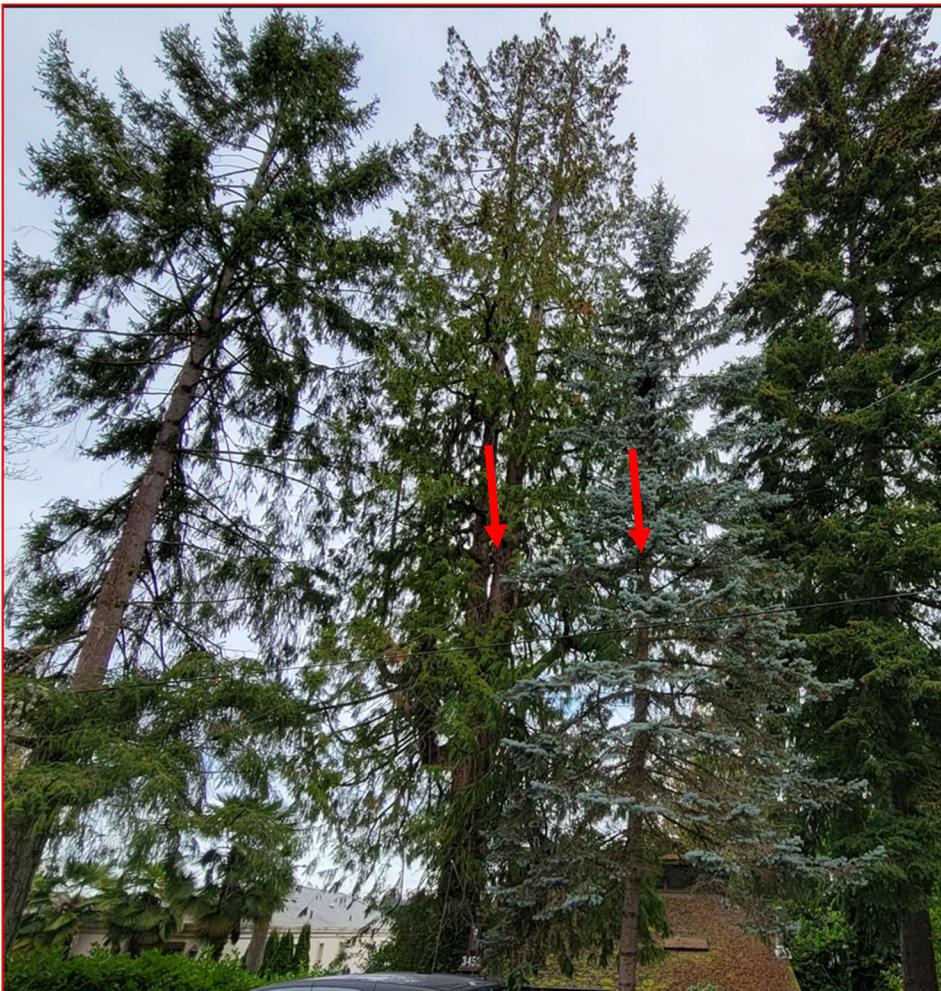
Photos taken from west of 3450 Evergreen point Road. The red arrows point to trees proposed for removal. The tree on the left side is of legacy size, which has been deemed a hazard tree.