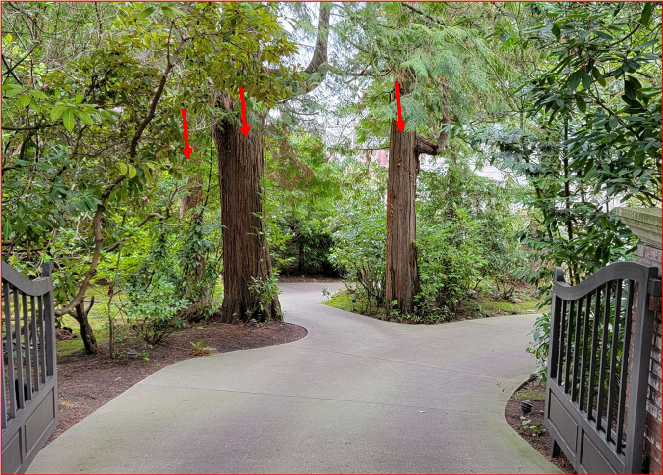
Photo taken west of 3444 Evergreen Point Road. Trees with red arrows are proposed for removal. The two trees on the left are of legacy tree size.