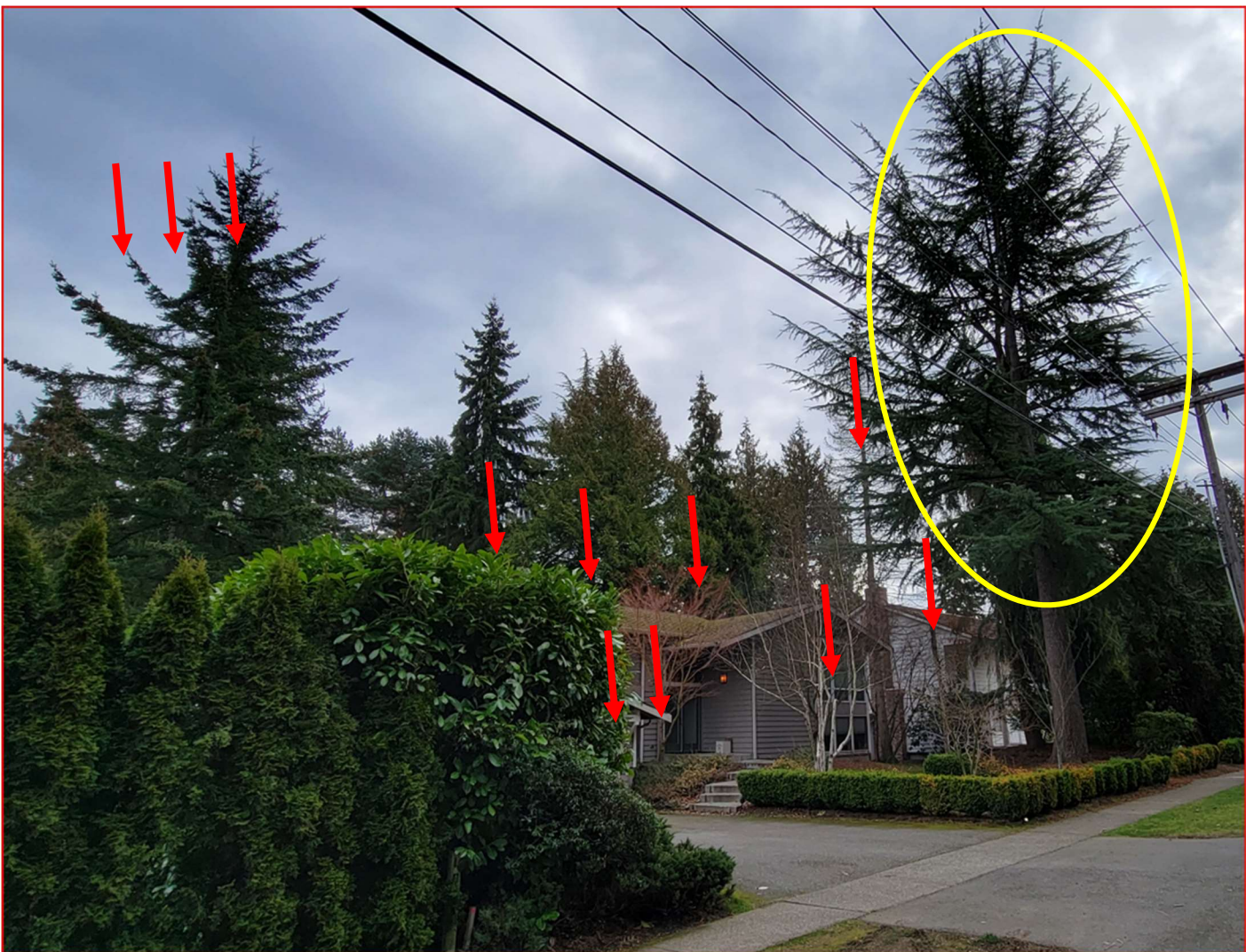
2420 76 th Ave. NE. - Red arrows point to trees proposed to be removed. No replacement required. Cedar tree in yellow ellipse currently proposed for preservation.