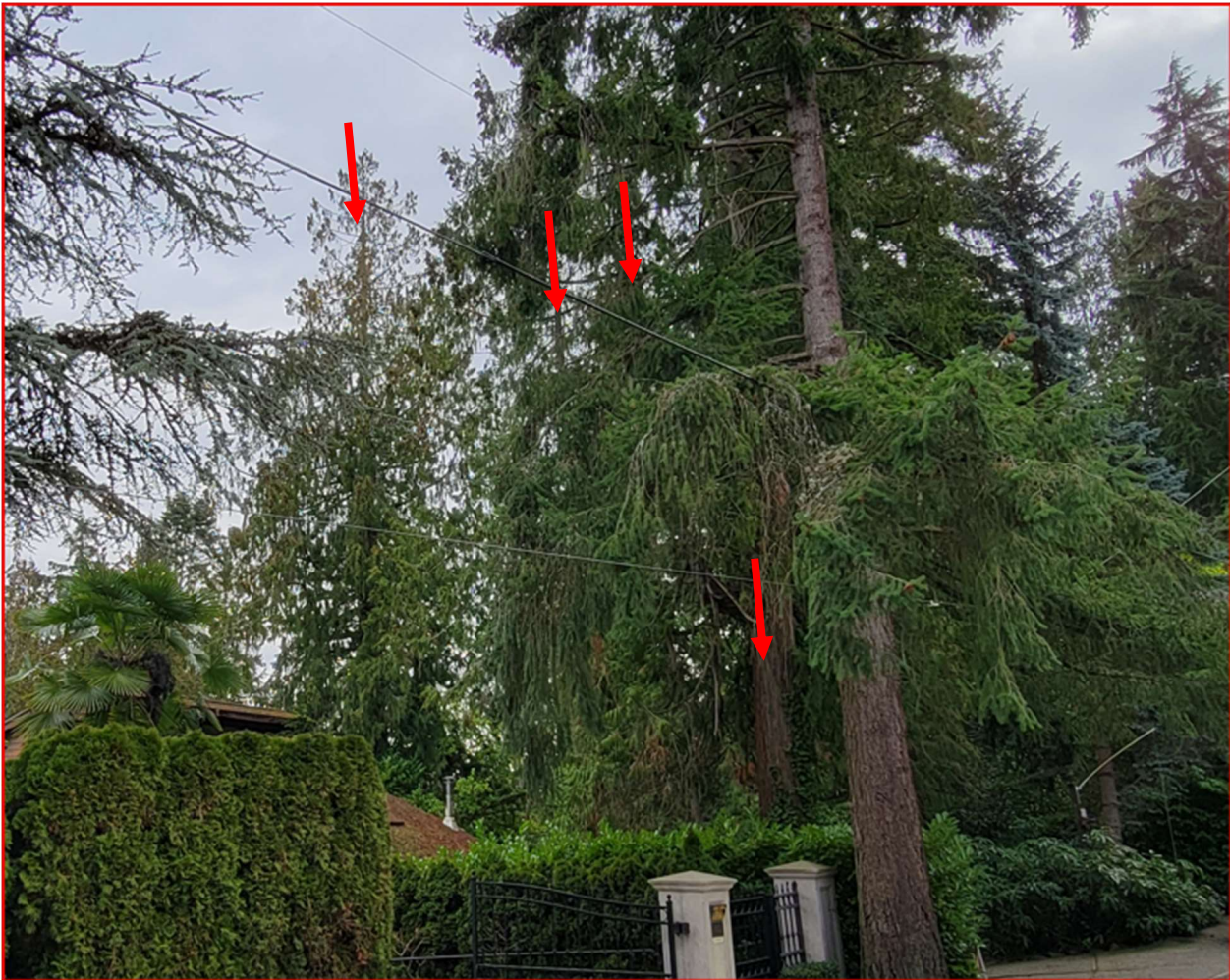
Photo taken from the northwest of the property at 3450 Evergreen Point Road. Red arrows point to trees at 3450 and 3444 Evergreen Point Road proposed for removal.