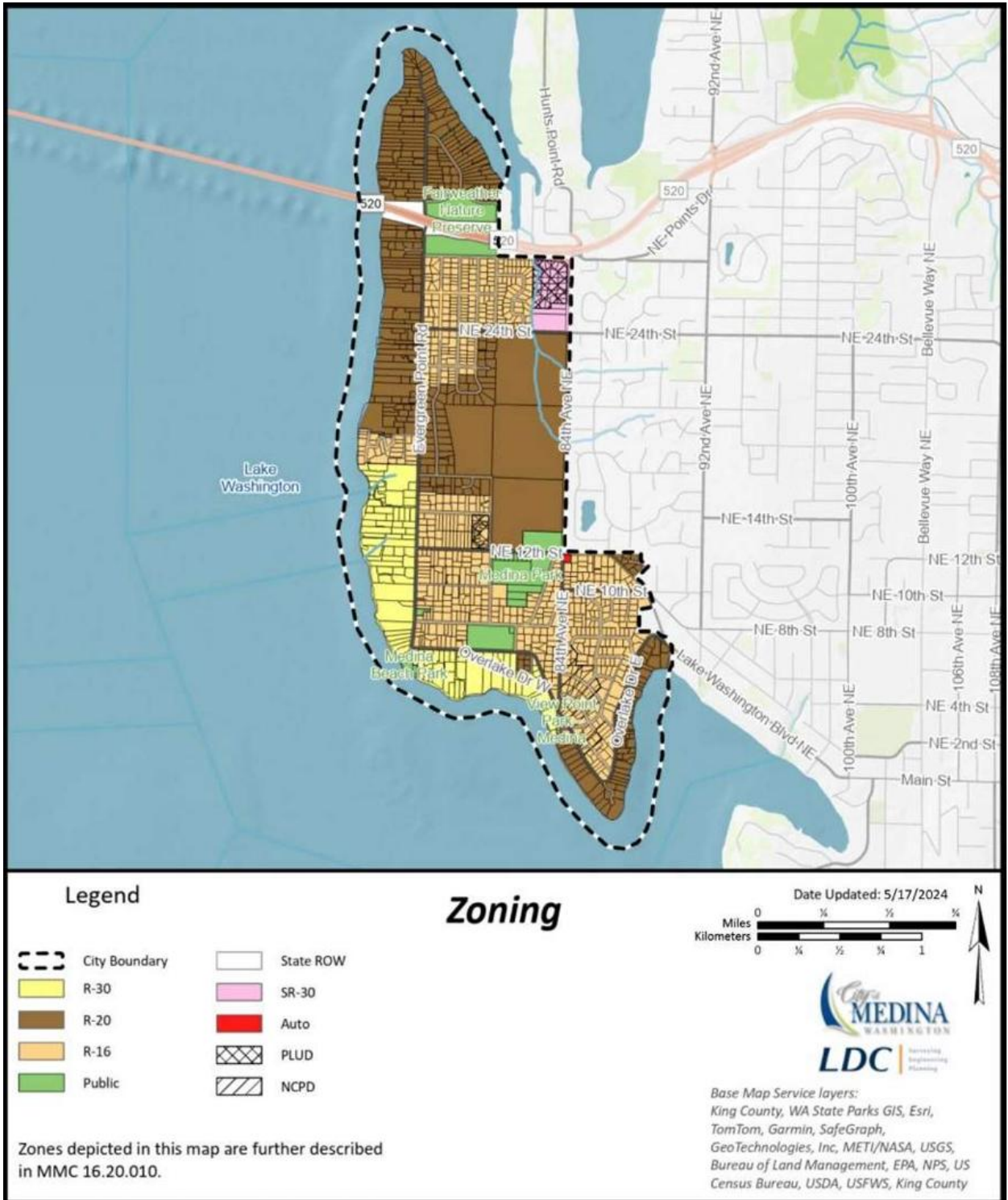
Source: Medina Comprehensive Plan Land Use Element