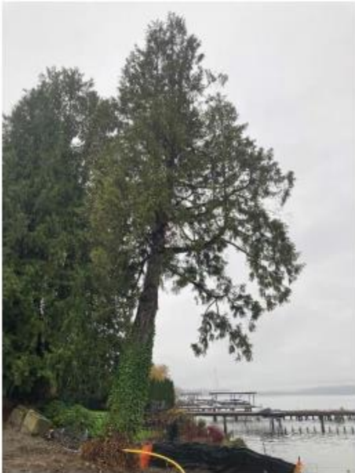
View northerly, note lean over dock