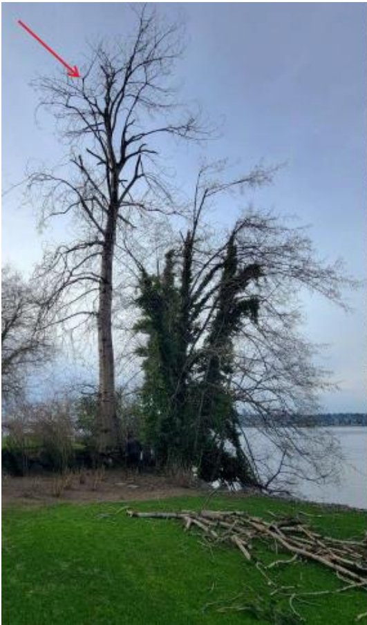
Picture 3. 1255 Evergreen Point Rd – Dying hazardous black cottonwood.