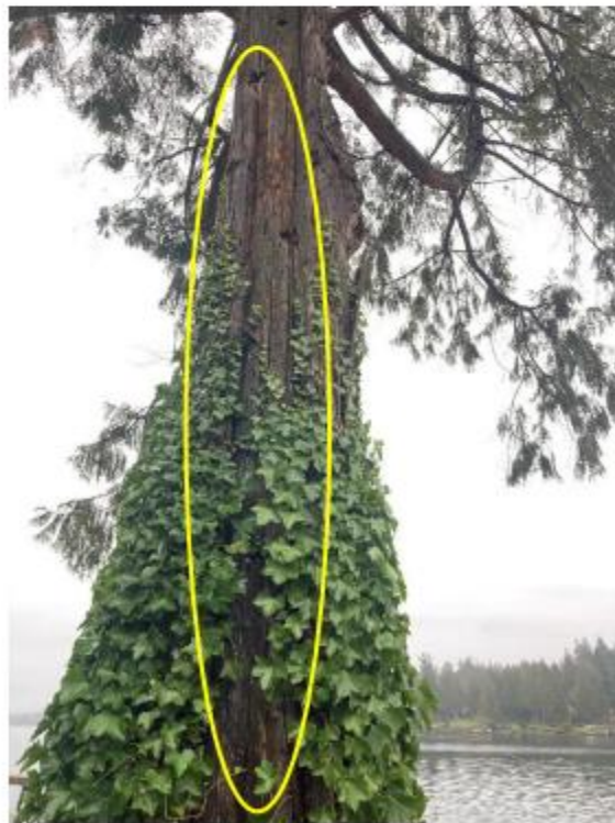
Open cavity the length of the main trunk