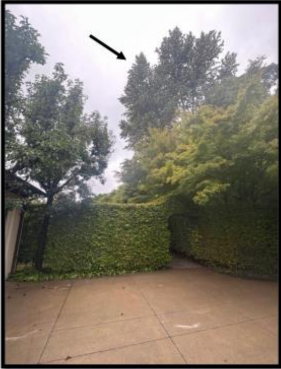
Photo 1: Looking north from driveway. Image shows overhang on yard.