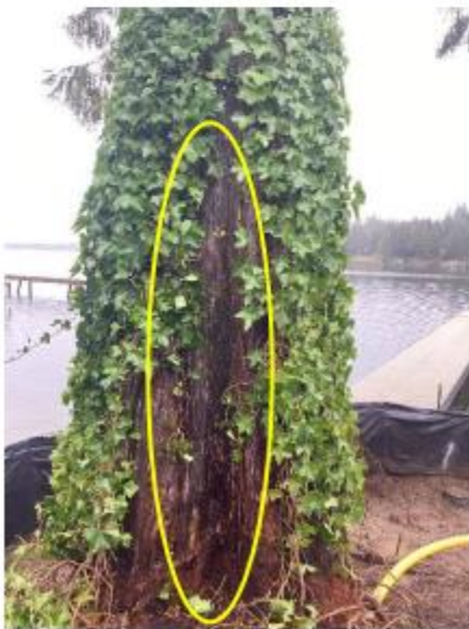
Open cavity at base of tree