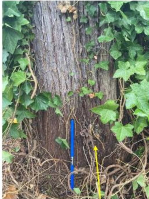
Decay apparent at root crown