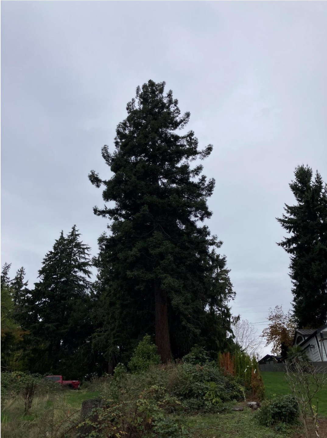
Picture 6. 116 Overlake Dr E – Hearing decision approved removal of 1 50" Giant Sequoia.