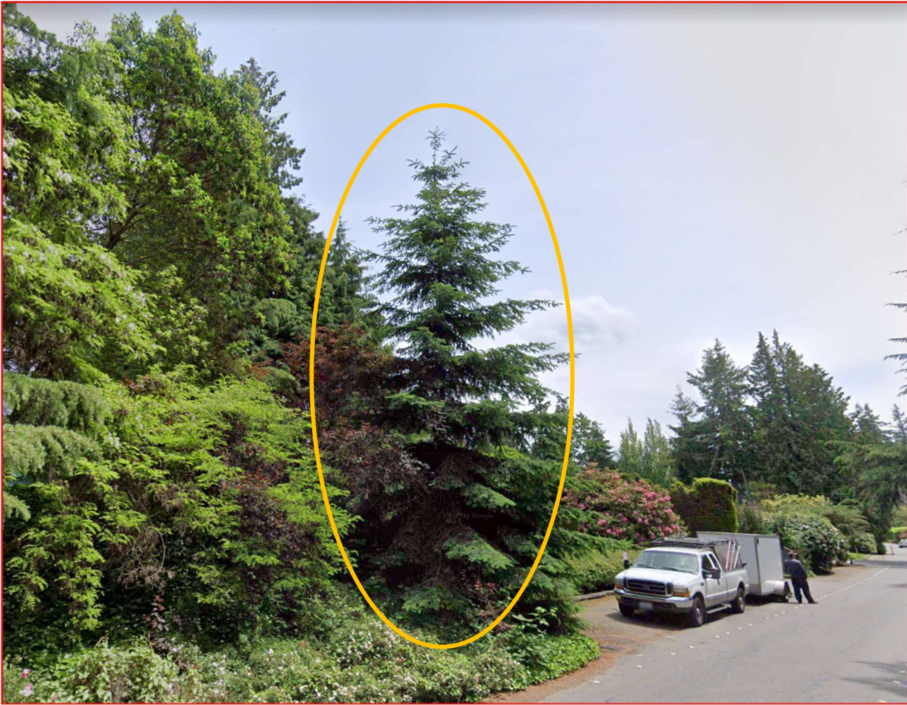
8718 Overlake Dr. W. Douglas-fir tree in right-of-way will be removed to gain access to the adjacent property.