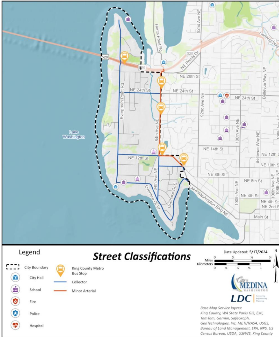
Figure 8 - Street Classifications