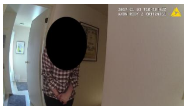
Targeted Video Redaction 1