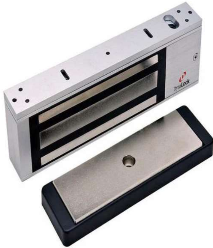
Magnetic door lock