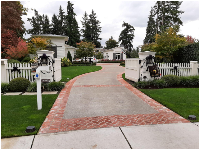
directly across the street from the subject property. This property has essentially no trees in front. These two properties demonstrate that the subject property has the same visual character, if not more visible trees.