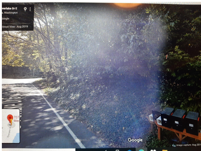
Historical photo from Google Street View from almost identical angle. White mail box of the 707 Overlake Drive East property is to the left but difficult to see.

Subject property. Street is Overlake Drive