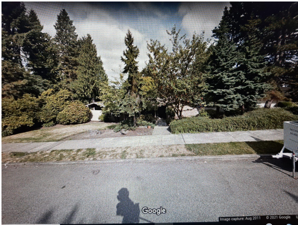
Google Street View of the old house. It is a small house out of character from its neighbors. Some of the eye-catching trees in the front yard are smaller fruit trees that may not be significant trees and are also easily replanted.