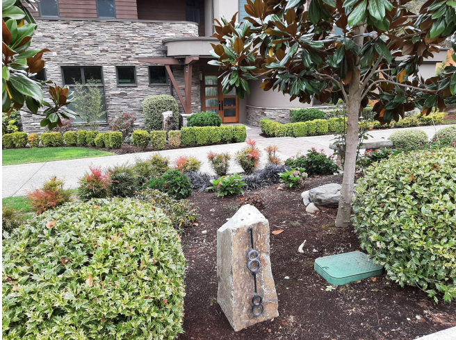
The detailed landscaping is also situated behind the sidewalk and in front of the entire house.