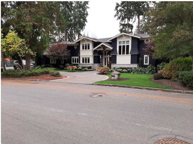
next door neighbor. Trees on the left mostly belong to the subject property, not this house.