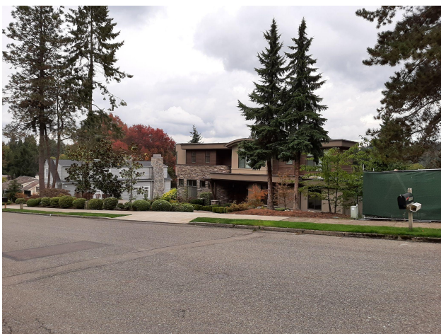
Note that neighboring property to the left lacks the tall trees of subject property