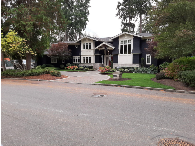
next door neighbor. Trees on the left mostly belong to the subject property, not this house.