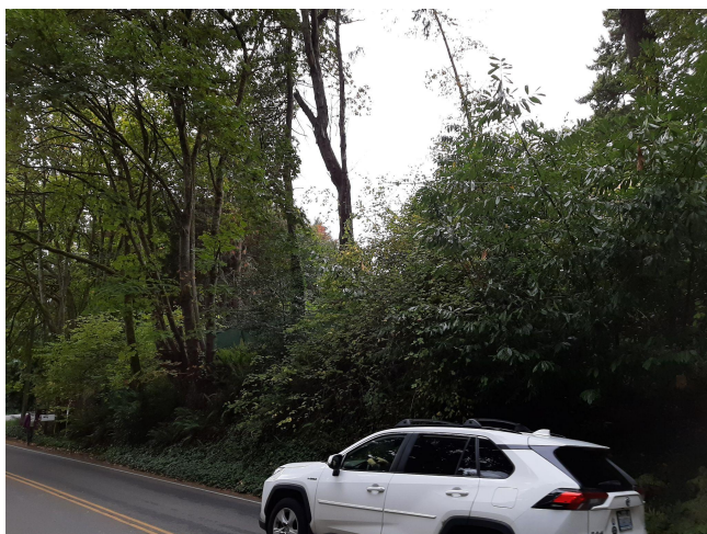
Subject property. Street is Overlake Drive East. 707 mailbox (white) is on the left.

Attached are photographs of the property in 2019 (source: Google Street View, date of image at the bottom) and October 2021. In view of the house being under construction and in an early stage of construction, it is not possible to judge the aesthetics of the house or future landscaping. However, the current state of trees viewing from Overlake Drive East remains forested (compare pre-construction Google Street View versus October 2021 where it appears that all trees have been retained). Furthermore, attached is a photograph of the property's next door neighbor. The neighboring property is attractive but has far less vegetation and trees than the subject property, 707 Overlake Drive East. This construction shows that the property is compatible and more heavily forested than the neighboring property and not evidence of a need for a stricter tree code.