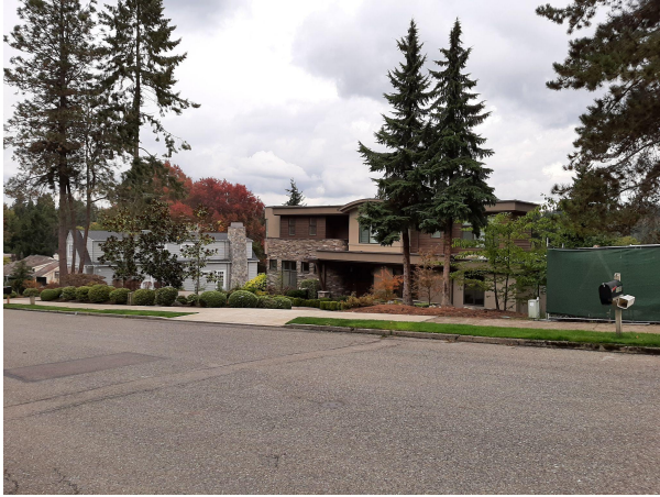
Note that neighboring property to the left lacks the tall trees of subject property