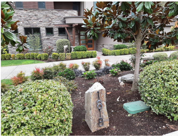
The detailed landscaping is also situated behind the sidewalk and in front of the entire house.

Attached are photographs of the property in 2011 and October 2021. The current new house is significantly more attractive than the previous condition. The current landscaping is very well kept and attractive as compared to 2011. When facing the front door, the current house has large trees to the right and to the left as well as in front of the house. It is unreasonable to consider this property as clear cutting of trees. In short, it is a beautiful house and property. This property is an improvement to the city and evidence that there is not a need for a stricter tree code.