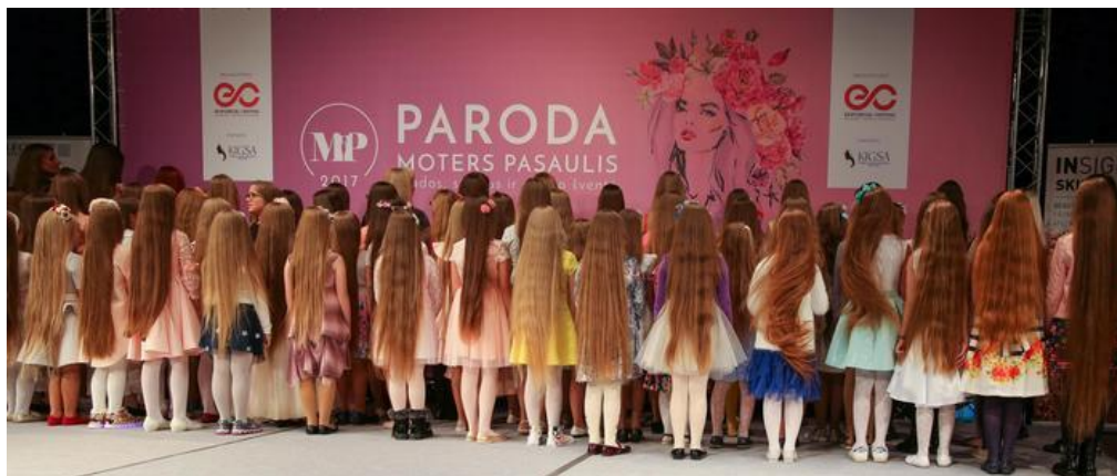
SBS TV, Australia)

A good tree plan would be where residents continually cut and replant trees. Some Medina residents are not happy that electricity often gets knocked out at least once or twice a year, sometimes for days, causing basement flooding due to electricity powered sump pumps without power when a tree takes down power lines. Historically, Medina was completely harvested for lumber less than 100 years ago, which improved public safety. Eventually, Medina should re-harvest trees, albeit on a careful and very staggered timetable. Trees might be like long hair. Long hair can be attractive but can become too long at a certain point.