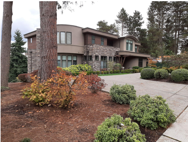
Foreground, background, and most trees to the photo's right in the subject property.