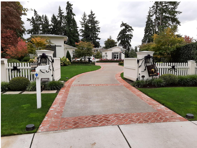
directly across the street from the subject property. This property has essentially no trees in front. These two properties demonstrate that the subject property has the same visual character, if not more visible trees.