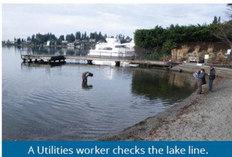
A Utilities worker checks the lake line.

Residents can offer input for management plan