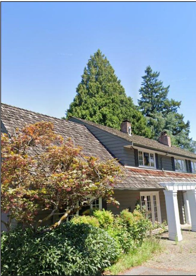
Figure 1. 49" DBH Legacy WRC behind home. Personally measured DBH to ensure accuracy.