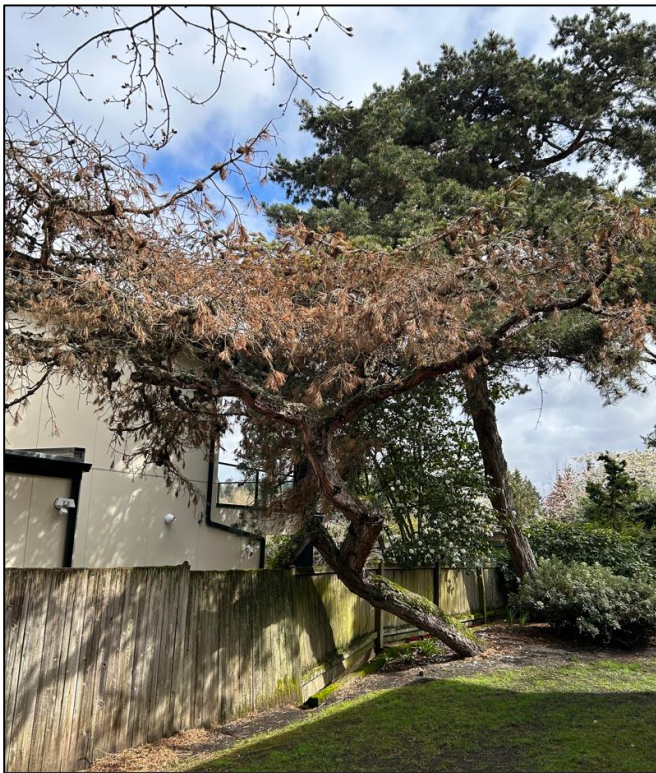
Picture 3. 912 87th Ave NE – Dead pine.