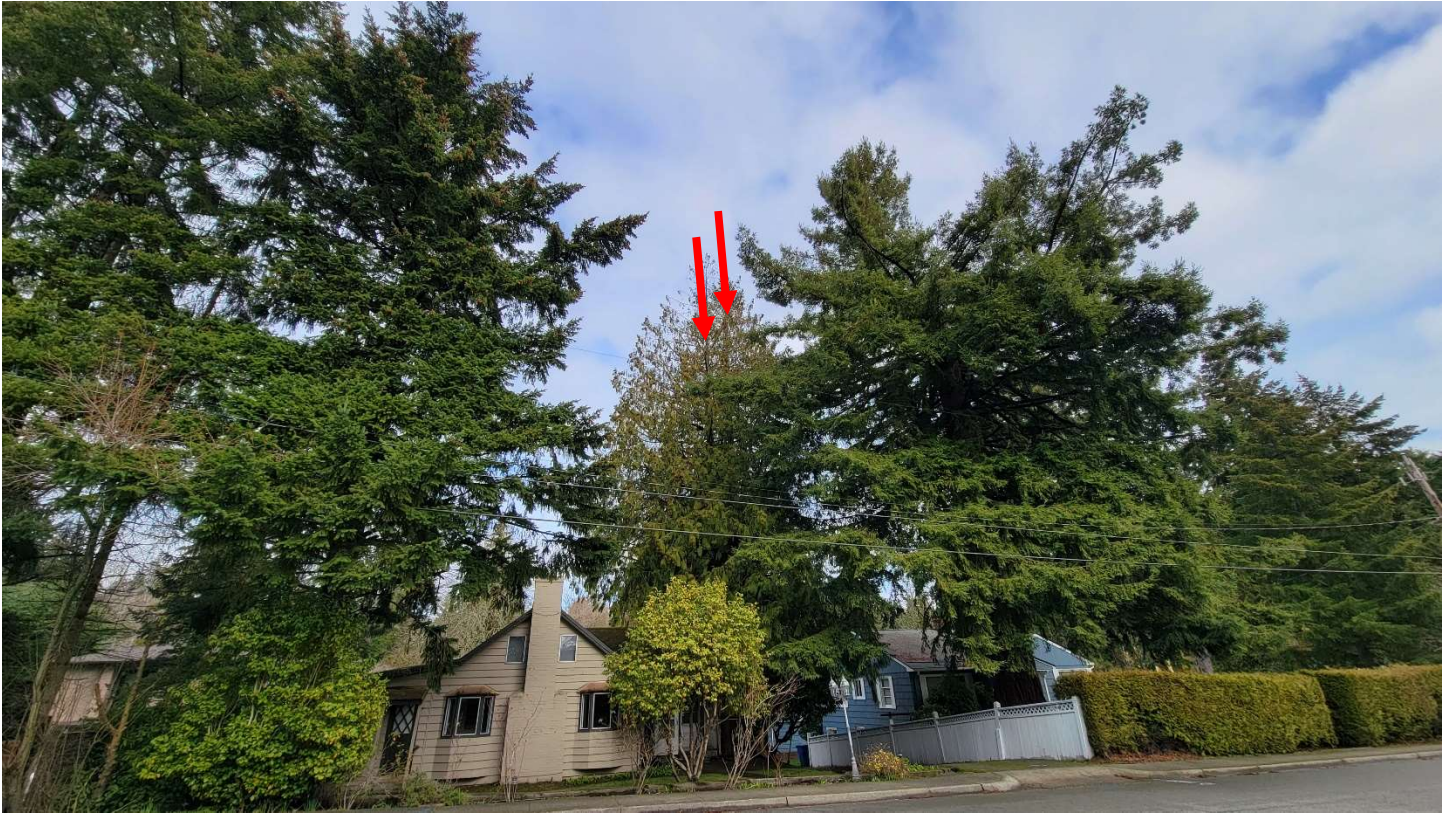
7645 NE 12 th St. - Red arrows point to two trees proposed to be removed, including a legacy tree.