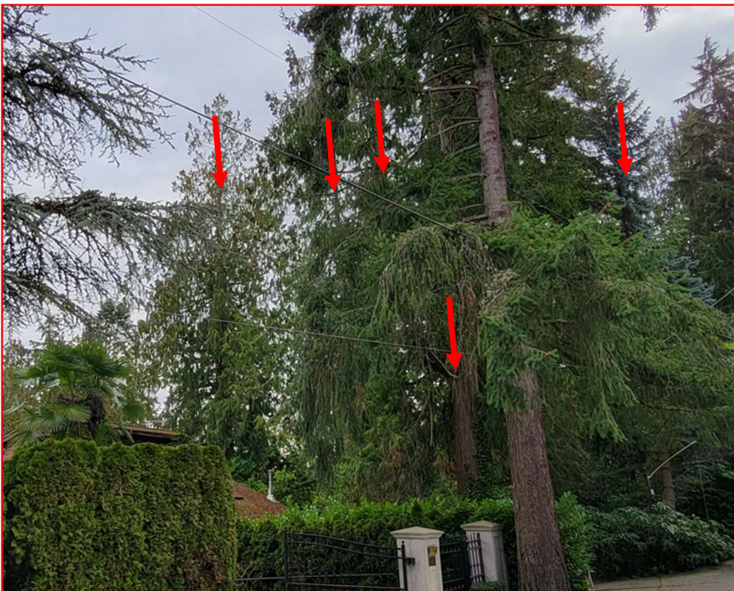
Photo taken from the northwest of the property at 3450 Evergreen Point Road. Red arrows point to trees at 3450 and 3444 Evergreen Point Road proposed for removal. Ten trees total are proposed for removal, including three legacy trees visible from the roadway.