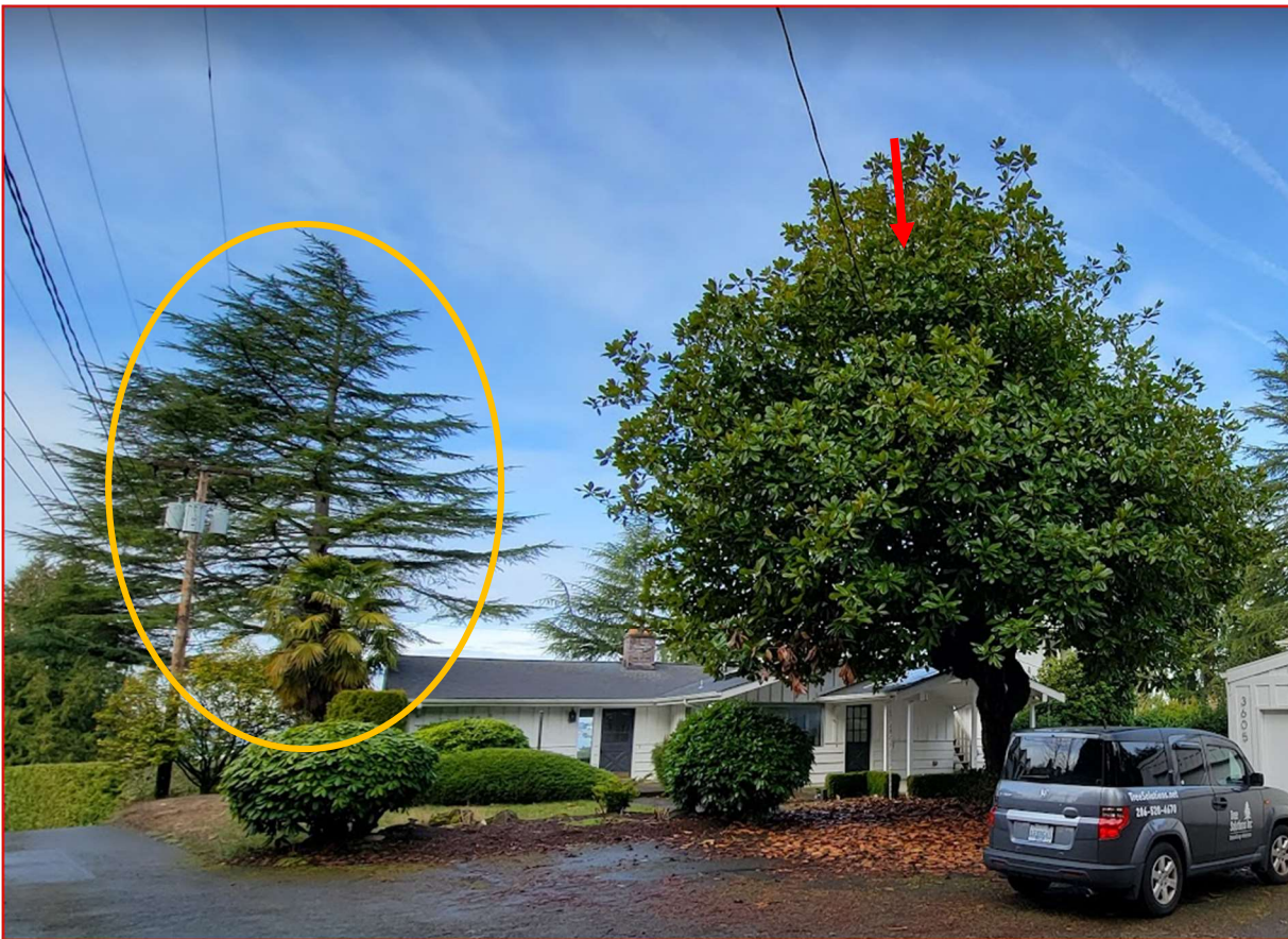
3605 Evergreen Point Rd. - Red arrows point to tree proposed to be removed. Cedar tree in yellow ellipse currently proposed for preservation.