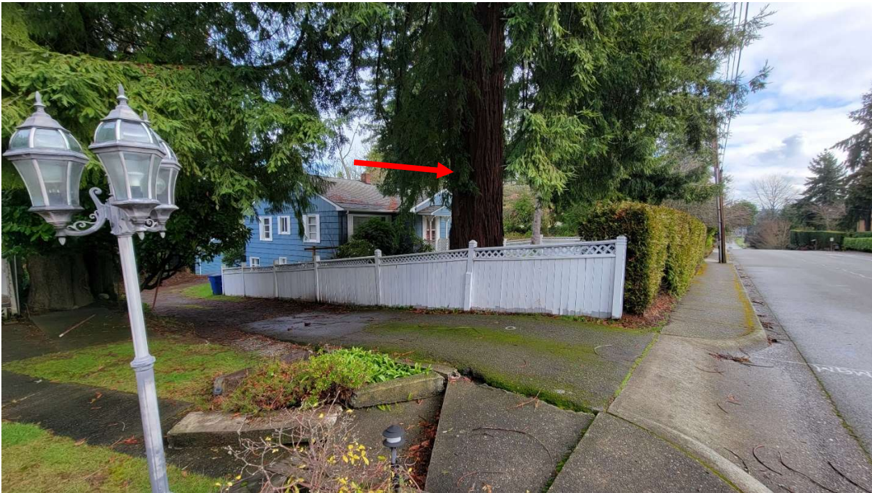
7645 NE 12 th St. - Red arrows points to a 50-inch diameter Redwood tree. The tree may be negatively impacted from adjacent site development. The tree does not meet legacy/landmark status since it is not a native species.