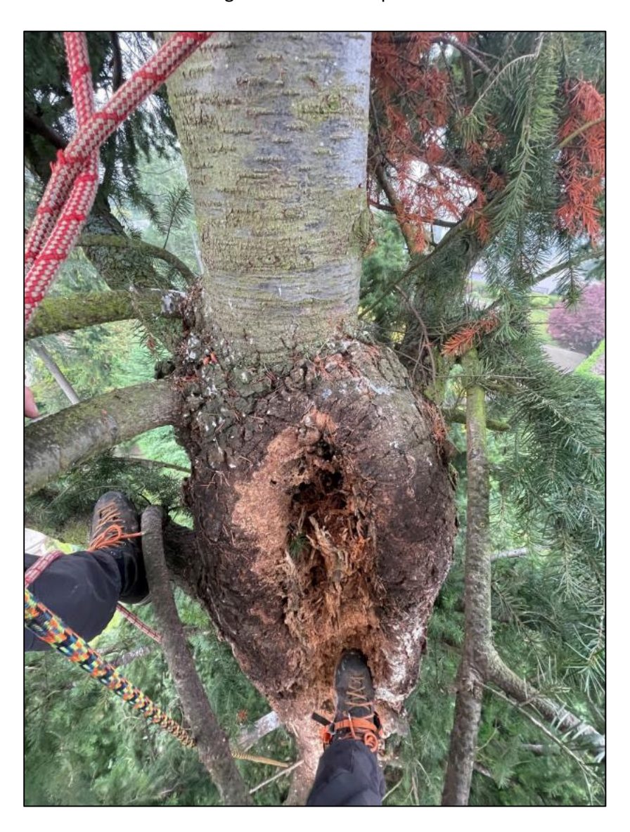
Picture 1. 3219 Evergreen Point Road – There is a large wound near the top of the tree. While it is not considered a "high-risk" tree, a neighboring property owner—who would likely be affected in the event of stem failure—expressed discomfort with retaining it. The resident opted to remove the tree.