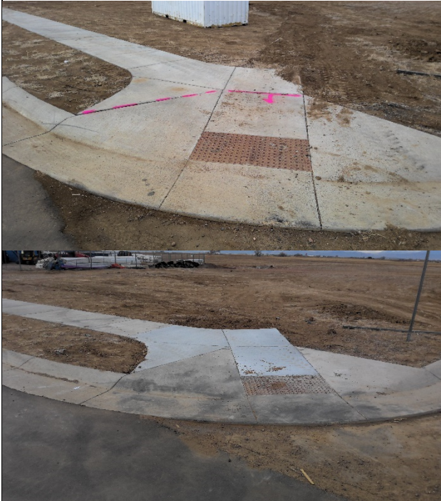
17- Couple panels in ramp need replaced at Harvest/Orchard