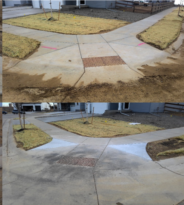
18- 2 panels need replaced on ramp at Harvest Dr/ Sunrise Pl