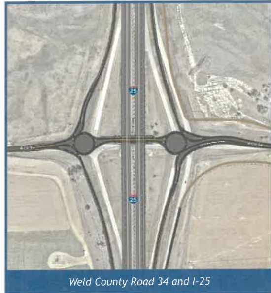
Weld County Road 34 and I-25

This project on the I-25 North corridor is a continuation of the approximately 20 miles of improvements that have been completed on I-25 between Berthoud to Fort Collins over the past six years. This approximately 6-mile project will expand and enhance I-25, from Colorado Highway 66 in Mead and connect to the newly built portion of I-25 just south of CO 56 in Berthoud. Once complete in 2028, this project will complete a major missing puzzle piece on I-25 and will be the first time there will be more than two lanes of I-25 from Denver to Fort Collins in both directions.