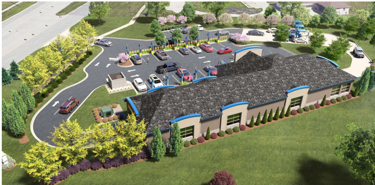
Renderings – “Jax Kar Wash”

Per Section 10.326(8)(q) of the Zoning Ordinance, vacuuming areas related to auto wash uses are required to be placed within a building. The applicant requests a variance from this standard to allow approximately nineteen (19) outdoor vacuum stations adjacent to the auto wash and allow for outdoor hand towel drying. Per the site plan and renderings (shown below), the vacuuming stations will be screened from Stephenson Highway by the auto wash building and screened from Stephenson Highway by a landscape buffer. The motors and mechanical equipment powering the vacuums are proposed to be enclosed within the building.