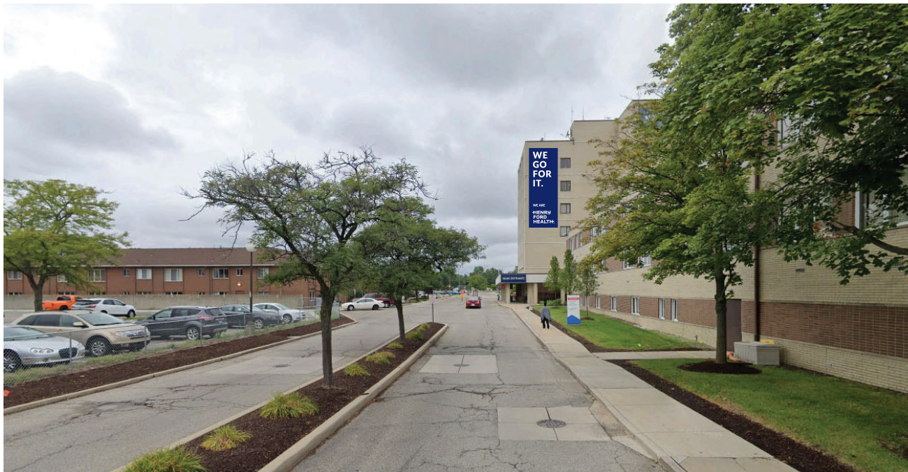
Henry Ford Health 27351 Dequindre - Temporary Banner - East Elevation