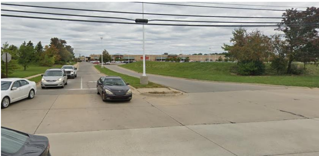
Buildings with Significant Setbacks (>150 feet from Right-of-Way)

The existing language provides a bonus wall sign area allowance for tenants that have street-fronting facades length in excess of 200 feet. Staff proposes changing this bonus allowance to apply to primary façade lengths, even those not fronting a street, in excess of 200 feet. Staff also proposes to extend this bonus allowance to buildings/tenants whose primary façade is greater than 150 feet from the right-of-way line of the adjacent street to allow for greater visibility.