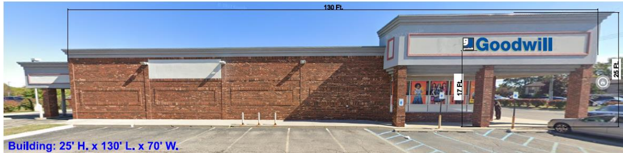
Building: 25' H. x 130' L. x 70' W.