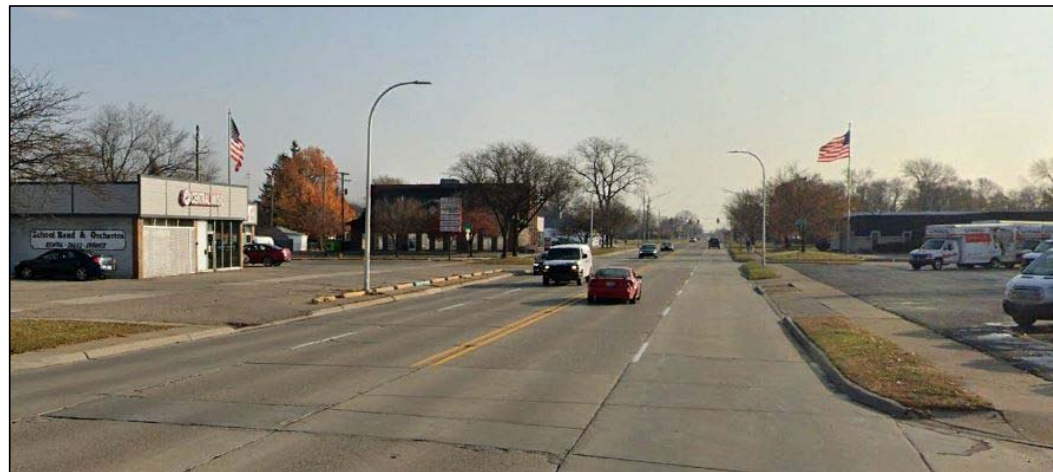
11 Mile Rd, Madison Heights, MI