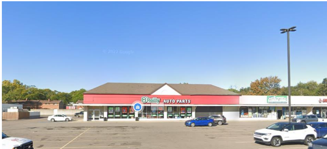
O'Reilly Auto Parts: 115 square feet