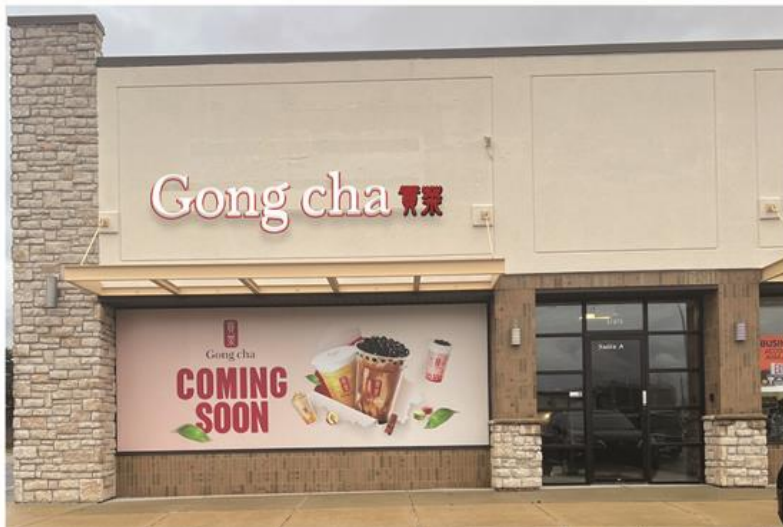
Gong Cha: 45 square feet