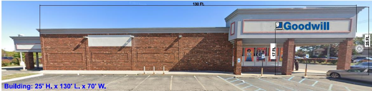
Goodwill: 80 square feet