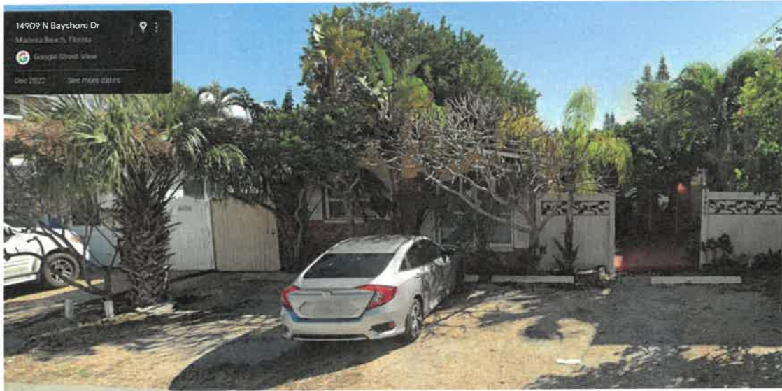
Via Google Images December 2022

Therefore, if the action(s) specified in this notice is not completed by 8:00 am of the re-inspection date listed, the City will take legal action concerning this violation(s). This action may include the issuance of a citation and imposition of a fine of up to five hundred dollars ($500) per day. The City may also take the required action itself and lien the above property for all costs associated therewith, including an administrative fee of one hundred dollars ($100).