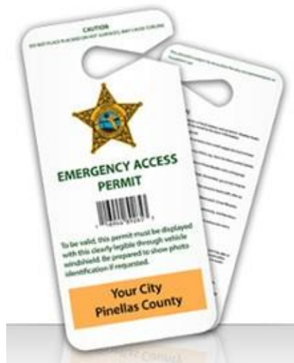
Sample Publication not for Official Use.

Anyone without the emergency access pass will be denied entry.