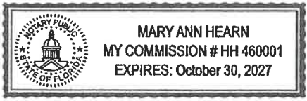
Notary Public Stamp

Personally known or produced _____ as identification.