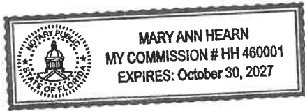
Notary Public Stamp

Personally known or produced _____ as identification.