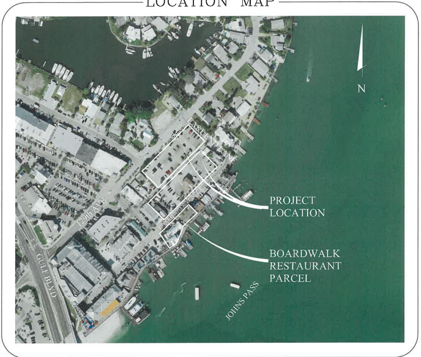
— LOCATION MAP —