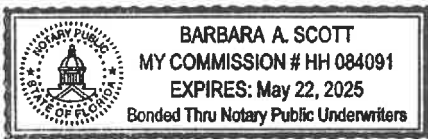
Notary Public Stamp

Personally known or produced _____ as identification.