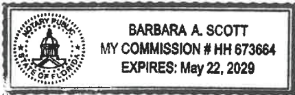
Notary Public Stamp

Personally known or produced _____ as identification.