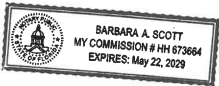
Notary Public Stamp

Personally known or produced _____ as identification.